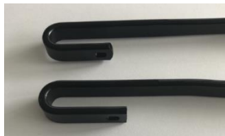
Top : new arm

This came along with slight changes of the wiper system: Scania created a brand new shape of the 12x4 U-hook arm ; dimensions of claws also changed, former vertebra design was also reshaped.